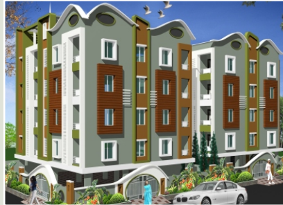
NAVYA MANSION AT RAJA RAJESHWARI COLONY, KONDAPUR