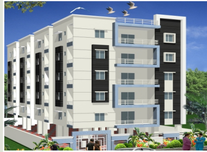
NAVYA MEADOWS AT VIJAYAWADA