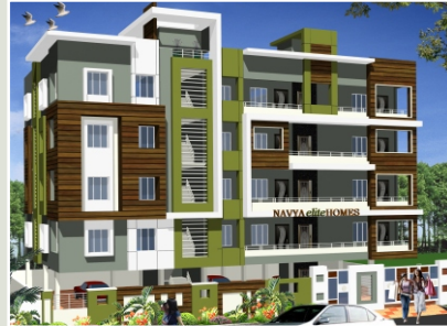
NAVYA ELITE HOMES AT RAJA RAJESHWARI COLONY, KONDAPUR