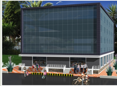
NAVYA VAZEER ESTATE AT L.B NAGAR