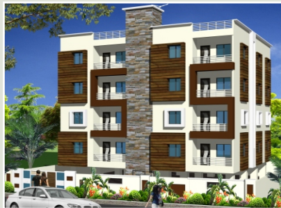
NAVYA SPRINGS AT NAGOLE