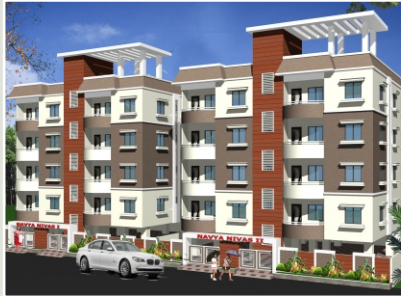
NAVYA NIVAS AT RAGHAVENDRA NAGAR, KONDAPUR