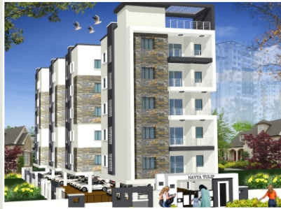
NAVYA TULIP AT NAGOLE